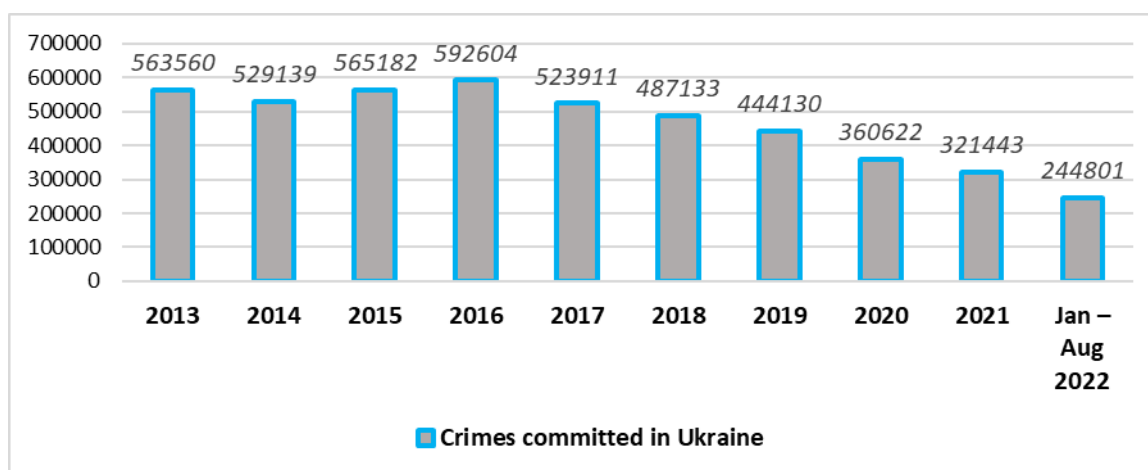
Fig. 2. Crimes committed in Ukraine (January 2013 – August 2022)

theoretical provisions for the science of forensics regarding the concept, subject matter, significance, sources, techniques, special methods, forms and purposes of application of the methodology of forensic prevention of crimes against the foundations of national security.